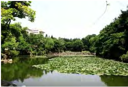
Taeback-Gwan (Shinhan Bank and International Affairs)